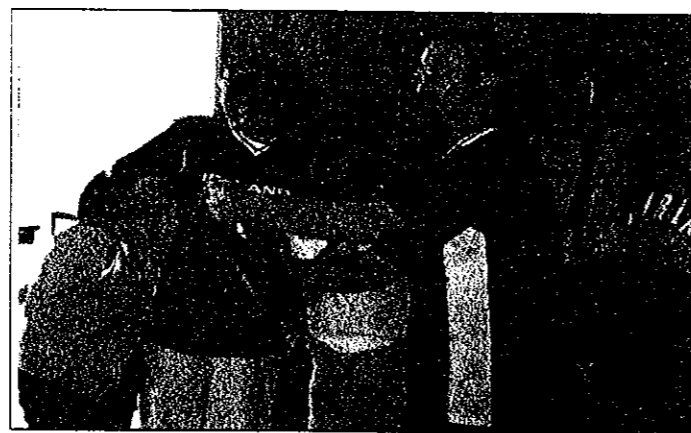
Celebration time! During the World Cup last Summer.

We were very busy rehearsing for most of the term for the Christmas concert in Enniscorthy "A Step into Christmas" was a huge success and thanks to all who supported it. The party in the Riverside on the Wednesday night after the show was also a wonderful night.